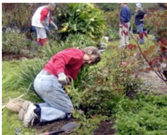
FRIENDS OF VINTAGE GARDENS WEEDING AND MULCHING THE TEA ROSES