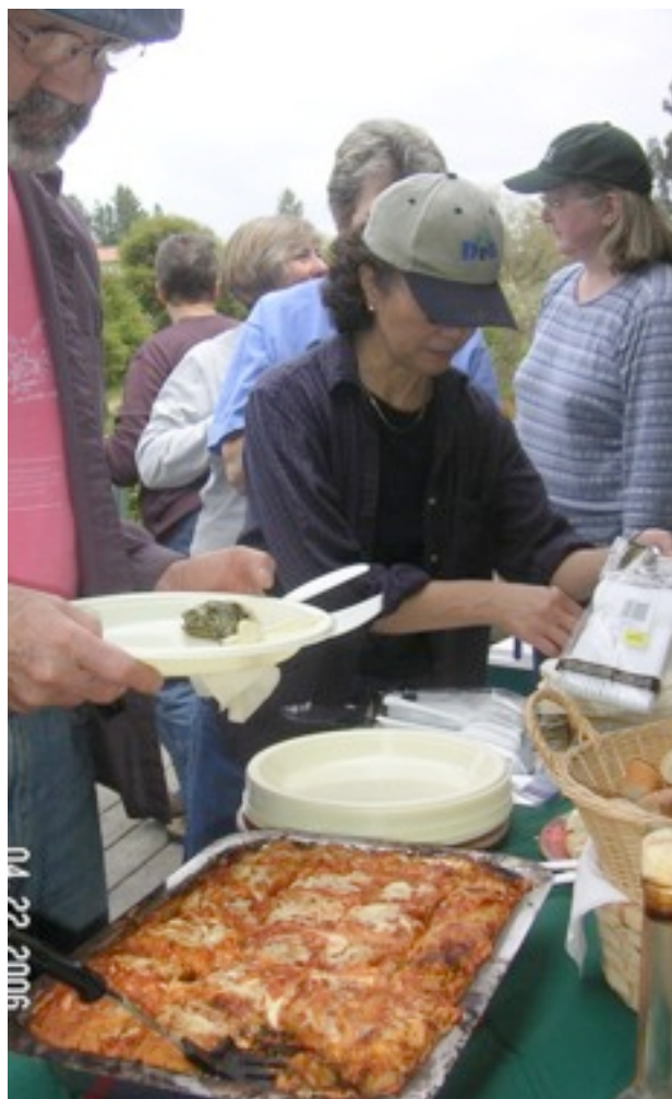
The workers feast on Dirt Day

Vintage Gardens 4130 Gravenstein Hwy North Sebastopol, CA 95472 707-829-2035